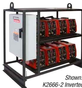
Shown: K2666-2 Invertec® V275-S (Tweco®) 8-Pack Inverter Rack

For more information, see publication E5.92