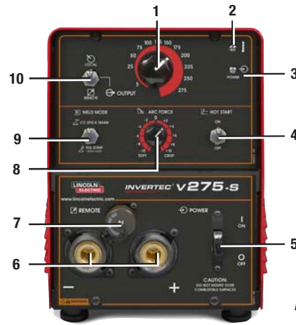
Shown: K2269-3 Inverter® V275-S