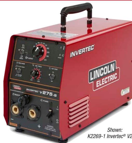
Shown: K2269-1 Invertec® V275-S